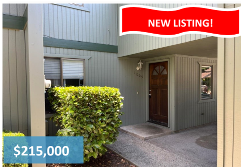
1005 SE Camelot Dr—Grants Pass Condo—2 Bd / 1 Ba / 1008 SF / Updated—Near Shopping!

Thinking is the hardest work there is, which is probably the reason so few engage in it.