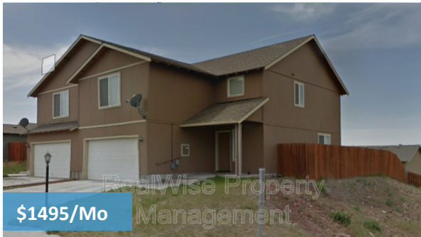
796 SW Maui Ln—Madras