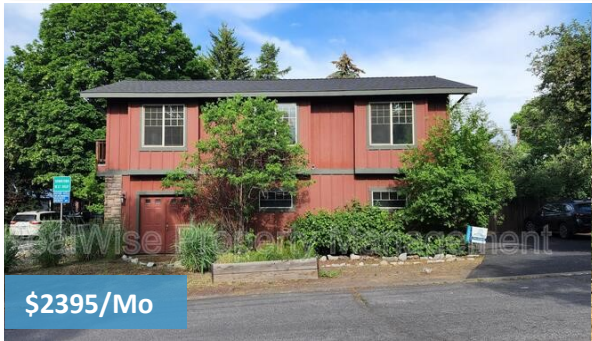
117 NW Staats St #B—Bend