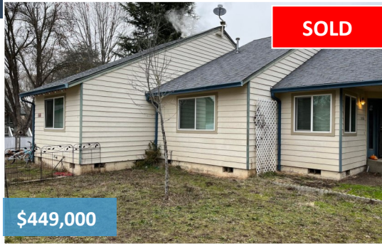
1006 S Shasta Ave—Eagle Point Duplex / 3 Bd / 2 Ba—Each Unit Great Investment Opportunity!