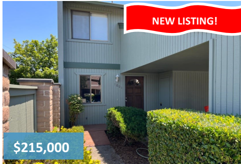
1001 SE Camelot Dr—Grants Pass Condo—2 Bd / 1.5 Ba / 1008 SF