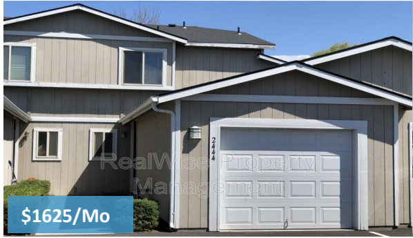
2444 SW 23rd St—Redmond