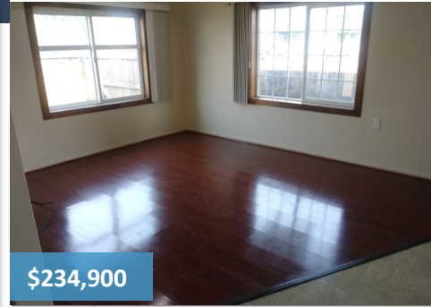
733 E. Milton St—Lebanon 3 Bd / 1 Ba / 920 SF / .23 Acres