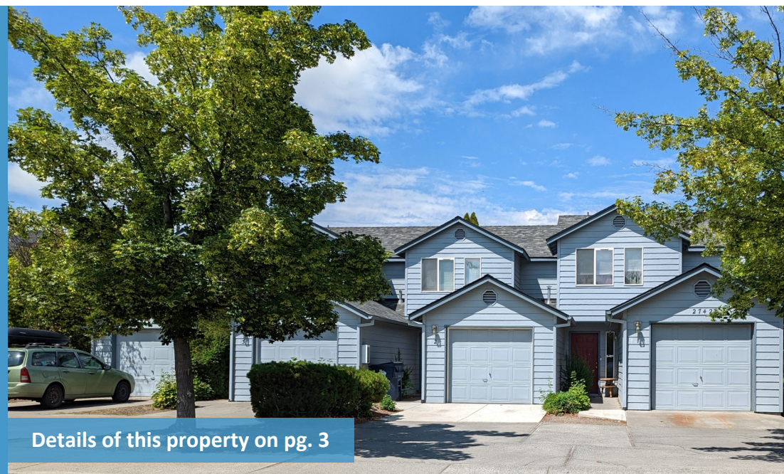
Details of this property on pg. 3