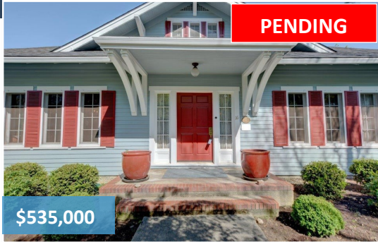
16 Geneva Street —Medford 4 Bdrm / 2.5 Ba / 2992 Sf / .26 Acres Old East Medford Historic District!