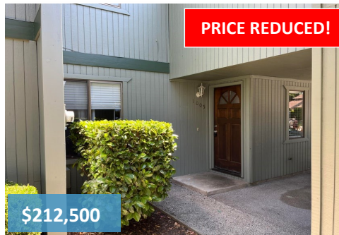
1005 SE Camelot Dr—Grants Pass Condo—2 Bd / 1 Ba / 1008 SF Updated—Near Shopping!