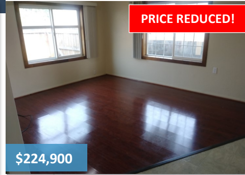
733 E. Milton St—Lebanon 3 Bd / 1 Ba / 920 SF / .23 Acres