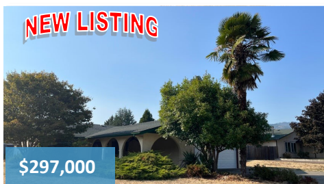
142 SE Nueva Dr—Myrtle Creek 3 Bdrm / 2 Ba / 1255 SF / .21 Acres