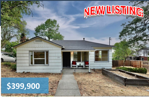
1210 Ashland Mine Rd—Ashland 2 Bds / 1 Ba / 780 SF / .16 Acres Beautiful Views Of The Valley!