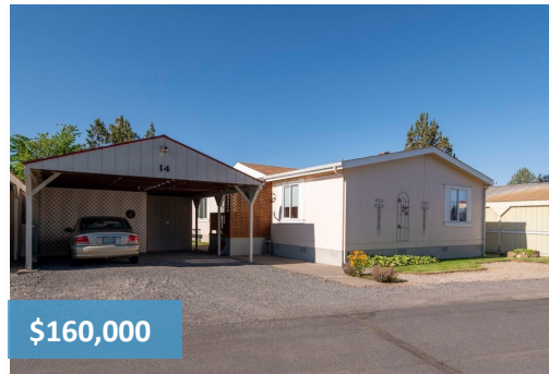
6100 S. Hwy 97 —Redmond 3 Bdrm / 2Ba / 1404 Sf Open & Bright—Lots Of Storage!