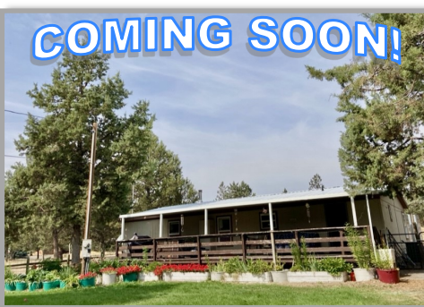
Prineville 3 Bdrm / 2 Ba / 1296 Sf / 5 Acres Large Shop/Garage!