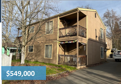
508 NW E St—A,B,C—Grants Pass 3—2 Bdrm / 1 Ba Units Nice Triplex! Great Investment!