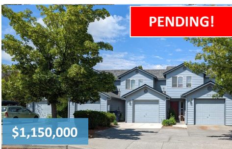
2742 NE Mesa Ct—Bend 8 Bdrm / 8 Ba / 3270 SF / .25 Acres