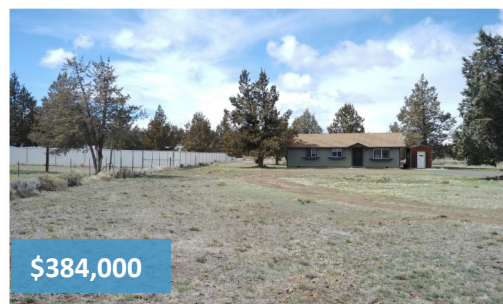
13214 SW Cinder Dr—Terrebonne 3 Bdrm / 2 Ba / 1188 SF / 1.01 Acres