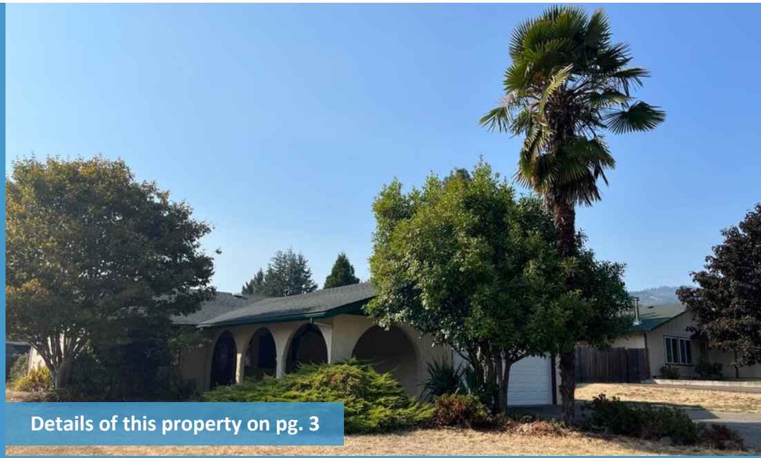
Details of this property on pg. 3