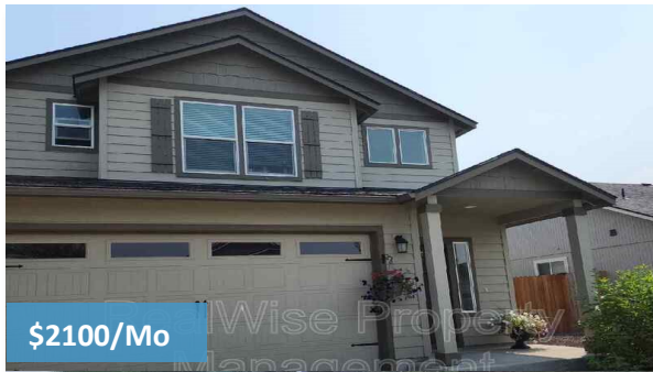
3612 SW Pumice Ave—Redmond