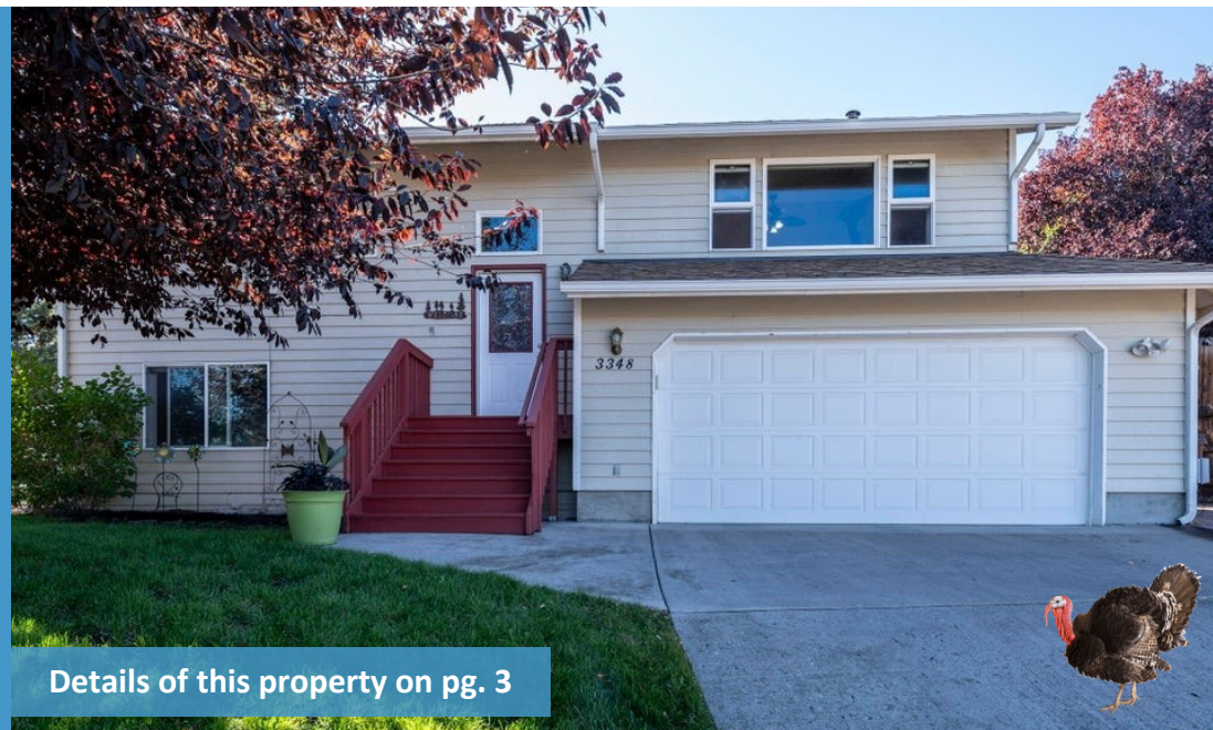
Details of this property on pg. 3