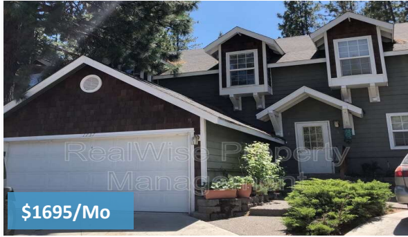
1757 SW Knoll Ave, Unit 4—Bend