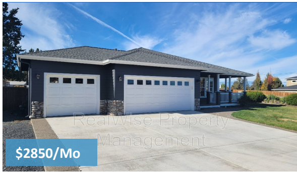
3721 SW Tommy Armour Ln—Redmond