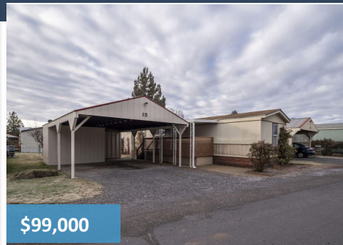
6100 S. Hwy 97 #15 —Redmond 3 Bdrm / 2Ba / 924 Sf