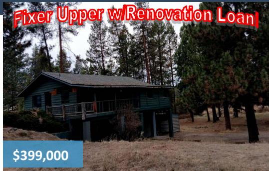
15638 Sherrie Way—La Pine 3 Bd / 2Ba / 1800 SF / 1.01 Acres River Frontage— Full Width of Property!