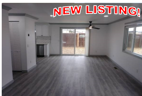
688 SE Centennial St—Bend Triplex—9 Bd / 3.2 Ba / 3256 SF Completely Updated in 2022/2023!

The first of April is the day we remember what we are the other 364 days of the year.