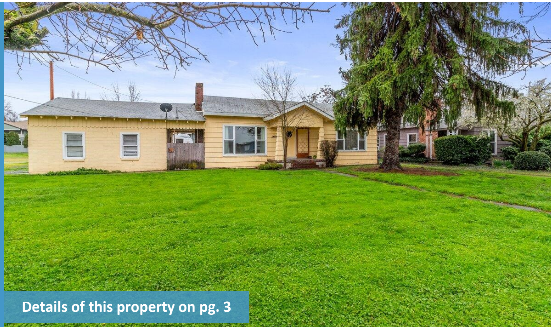
Details of this property on pg. 3