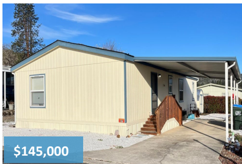
8401 Old Stage Rd #27—Central Point 3 Bd / 2 Ba / 1200 SF Madrona Hills 55+ Park—Nice Updates!