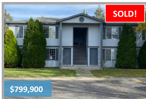
332 NW 17th St—Redmond 4 Units— 2 Bd / 1 Ba / 975 SF Each Nice 4-Plex—Great Investment!